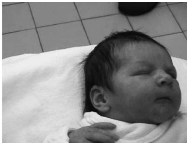
Figure 1b Mouth clutching.

Each infant was presented with two sounds: /a/ and /m/. Each sound was presented in a soft and stable way, and lasted 4 seconds. The interval between sounds was 1 second. The experimenter made /a/ or /m/ successively for 4 times, which formed one trial. Each trial was 20 seconds long. The interval between trials was 25 seconds. If the infants were upset, or yawned, or sneezed, the time between trials was longer since the experimenter waited until the infants had calmed down. Twelve of 19 infants received the stimuli with the order /m/ – /a/; the remainder ( n = 7 ) received the reverse order. Each infant was presented with 8 trials for each condition. Nine infants received additional trials because during the experiment they were upset or tired. The trials in which the infant was not in the appropriate status were excluded from future analysis. In the final analysis, each infant had 8 trials for each condition. The process of the experiment is shown in Table 1.